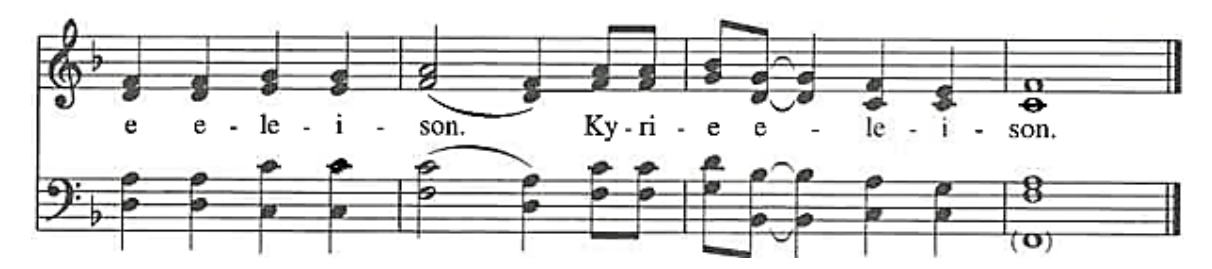
Music: Betty Carr Pulkingham (b. 1928) from Freedom Mass. Based on traditional African melodies. © CELEBRATION (Administered by THE COPYRIGHT COMPANY, Nashville TN). All Rights Reserved. International Copyright Secured. Used by permission.